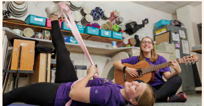
Student music therapy, yoga research