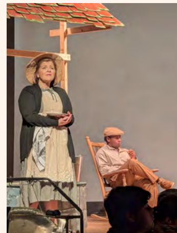
Rehearsal for opera "Gal Young 'Un."