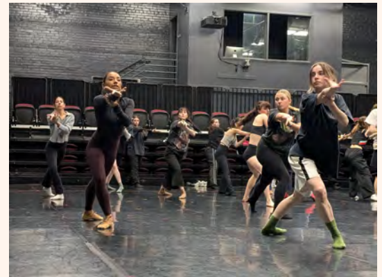
New York Theatre Ballet visits our dance classes.