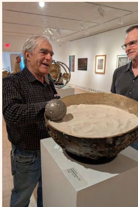
SOAD faculty art exhibition at Gray Gallery.