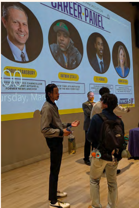
Conversations after the SOC alumni career panel.